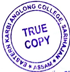
Sign. of Headmistress